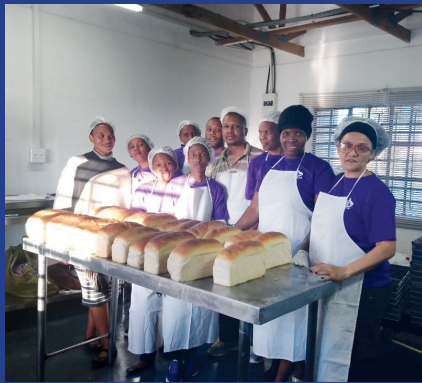
FEED MY PEOPLE BAKERY is a fact. Thank you for your support.